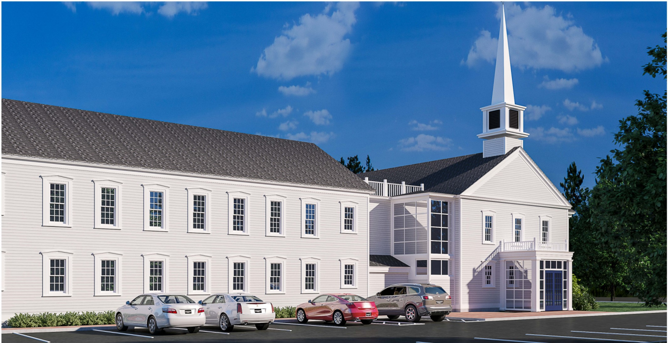
UCC Boxborough April 27, 2017