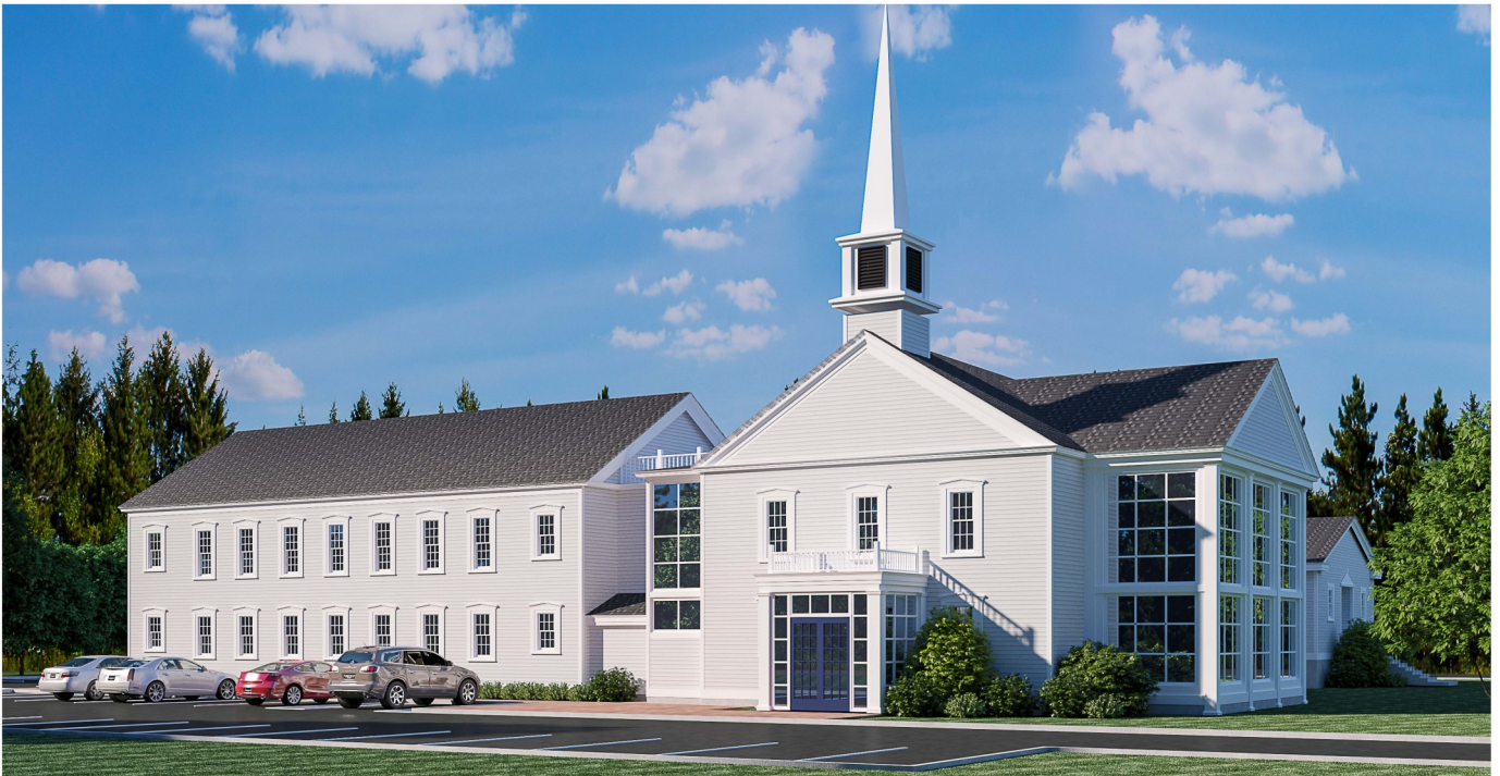
UCC Boxborough April 27, 2017