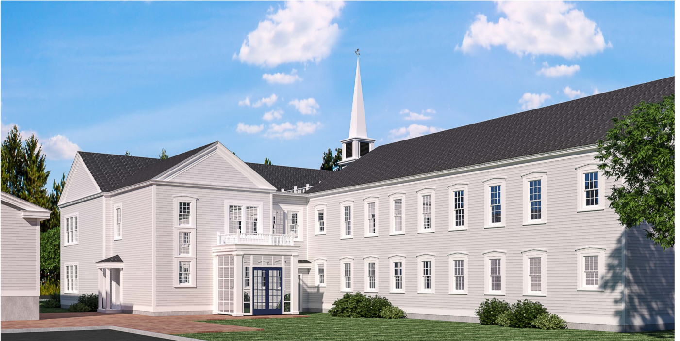
UCC Boxborough April 27, 2017