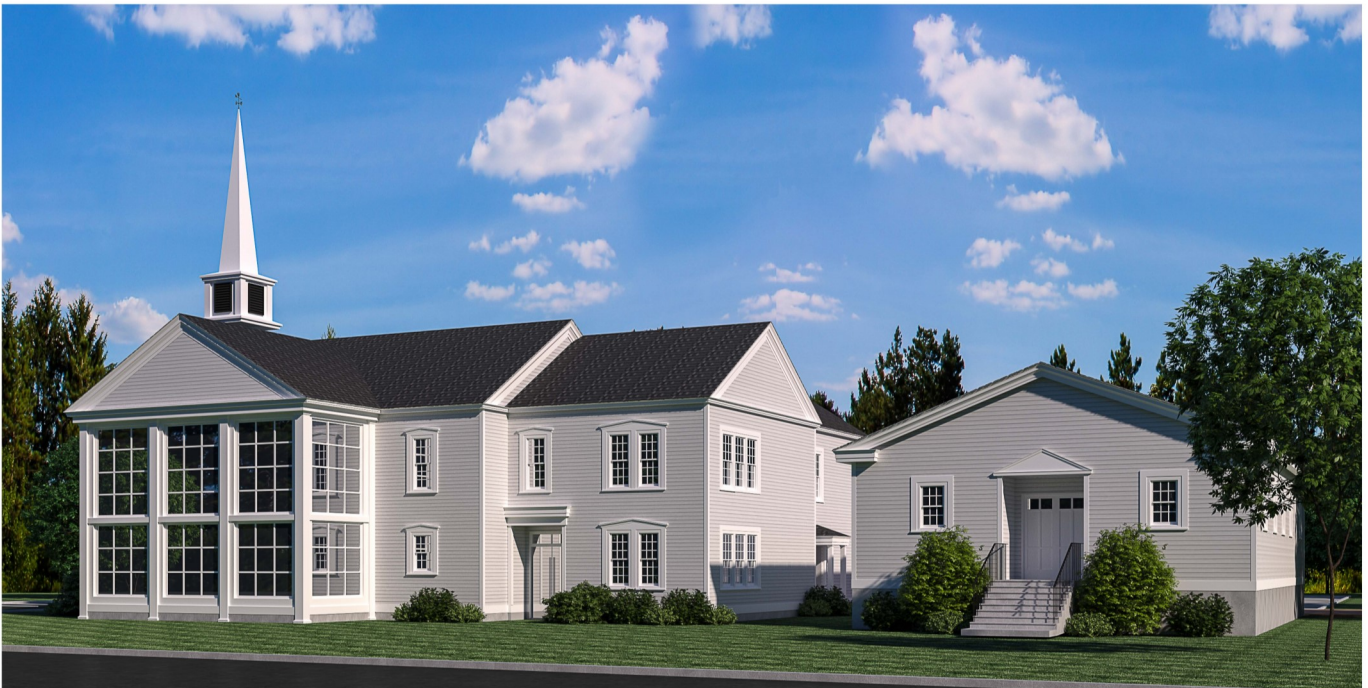
UCC Boxborough April 27, 2017